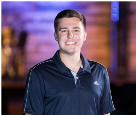
Pastor, Middle School Bellevue Baptist Church